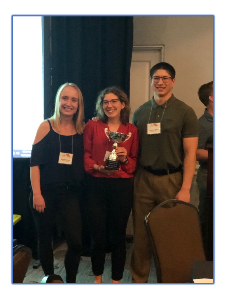
Cal Poly San Luis Obispo